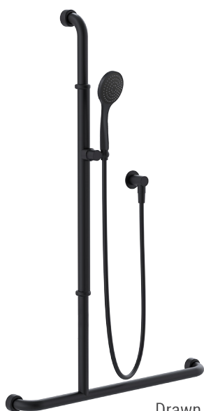
Drawn LH (Left Hand)